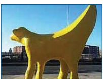
The Superlambanana which CMPB have had moved off their development site.

One of Liverpool's most distinctive pieces of art is being forced to move home – and it's all down to CM Parker Browne! Those who know about the exciting pace of regeneration taking place in the city will know that in preparation for Liverpool's 2008 European City of Culture status, a series of large pieces of public art with some reference to the Beatles and their song lyrics have been placed around the city.