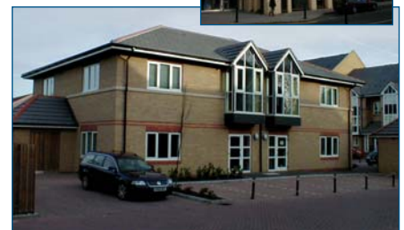
CM Parker Browne's new Guildford office

September, 2004, the Superlambanana's grazing days were numbered and the BBC news website reported the event on 13th April, 2005. We have needed to have the piece of art moved in order to undertake demolition works, build a two storey basement and car park and divert sewer mains and other services. Our Liverpool office project managers have arranged with the City Council to have it repositioned outside the John Moores University Learning Resources Centre.