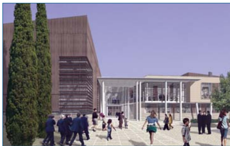
Northampton Academy