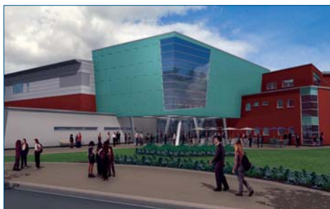
Manchester Academy