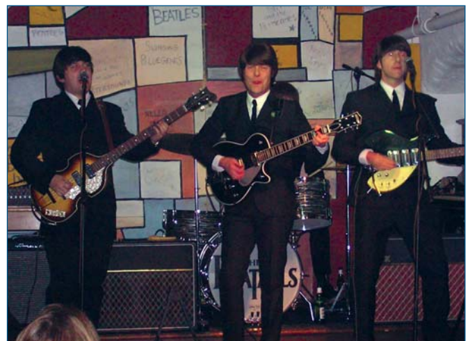
A Beatles Tribute Band playing at the recreated Cavern Club.