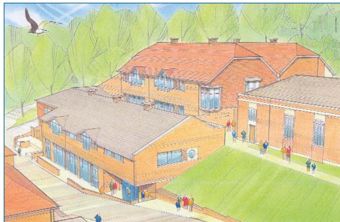
Caterham School Science and Dining Building.

Contractors Buxtons have, in the past month, been appointed to commence the construction of a new £5.5 million Science Laboratory building and new dining and catering facilities. The building has been designed by Hove architects, The Miller Bourne Partnership and construction work will commence on site at about the same time that the ISBA conference is commencing in May, 2005. The new facilities are due to open to the students in September, 2006. CMPB are Project Managers, Quantity Surveyors and Planning Supervisors to Caterham School.