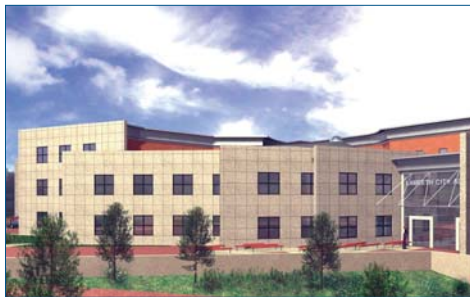
Lambeth Academy

ULT is currently involved with nine Academies – Manchester, Lambeth, Northampton, Paddington, Salford, Walthamstow, Barnsley and two at Sheffield. Working together as a group has significant benefits for teachers, pupils and parents. This feature of the Academies within ULT, together with the long experience in high quality education brought by UCST, makes this sponsorship unique in this country.