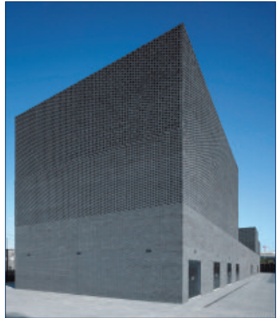
The Olympic Substation at Bow

The judges were impressed by the "elegant simplicity of the scheme that belies the complex brief", describing the building as "a powerful and convincing solution".