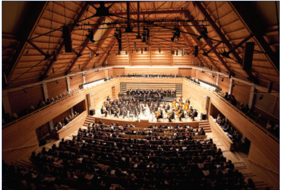
The opening concert at Sevenoaks Performing Arts Centre

The third award was for Sevenoaks School's Performing Arts Centre, which won the 'Best Education Building Award', and on which we acted as Project Manager and CDM Coordinator. Described by the judges as a "delightful building", it was credited for "exploiting the topography of the site and the creation of external spaces and internal volumes that combine to make a satisfying composition".