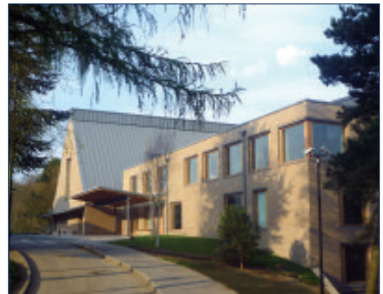
Sevenoaks Performing Arts Centre

The quality of the entries for the 2010 Brick Awards was extremely high which makes receiving these Awards even more memorable.